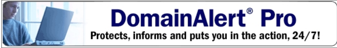
Figure 1 – DomainAlert product page